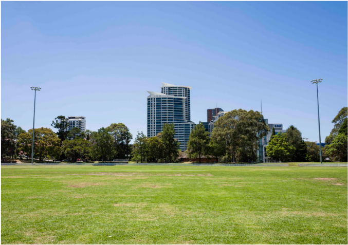
Location 9 - Gore Hill Park, looking east towards St Leonards