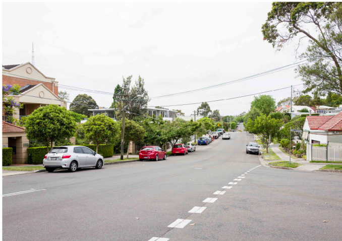
Location 7 - Naremburn Conservation Area