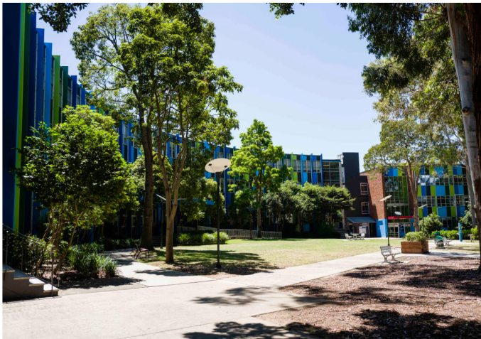
Location 4 - TAFE NSW