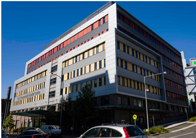
Location 3 - Royal North Shore Hospital