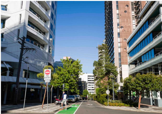
Location 2 -Atchison Street, looking west from Mitchell Street