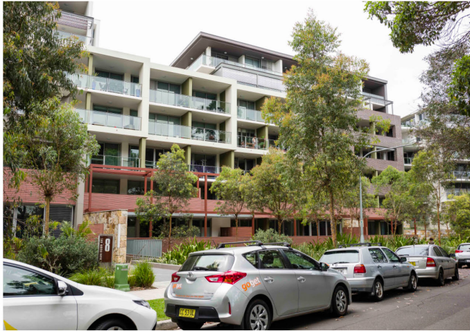
Location 11 - Medium Density along Duntroon Avenue