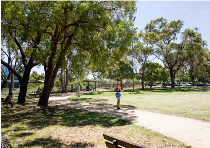
Location 12 - Naremburn Park