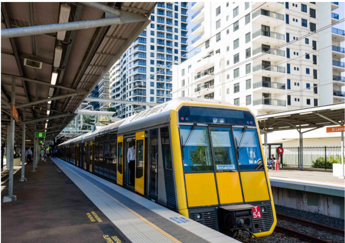
Location 1 - St Leonards Station and The Forum