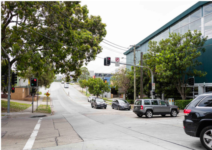
Location 8 - Reserve Road