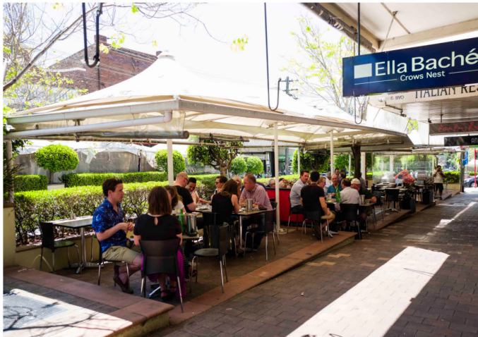
Location 6 - Eat Streets of Willoughby Road