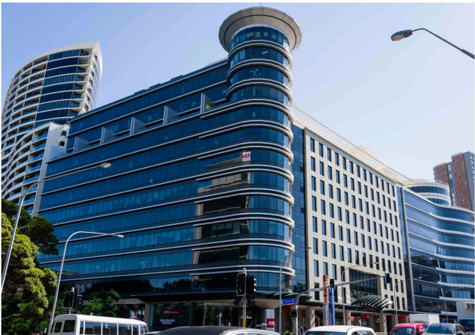
Location 5 - The Forum, looking east from Pacific Highway