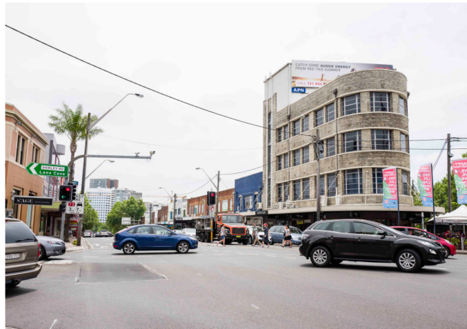
Location 10 - Crows Nest, looking north from Pacific Highway Fiveways Intersection